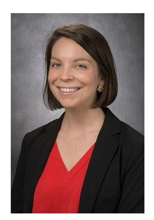
Bonus fun fact: The first and only time I have camped in the snow was here in TX.