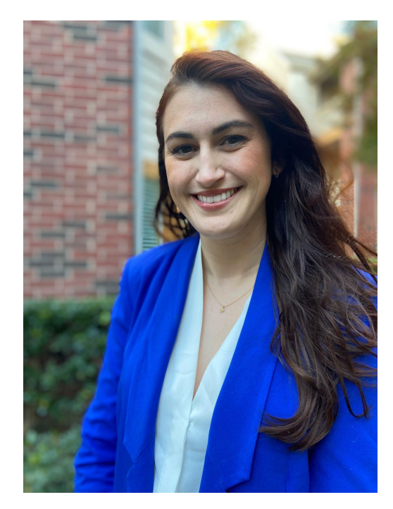
Bonus fun fact: I'm from the town where they film the show Swamp People